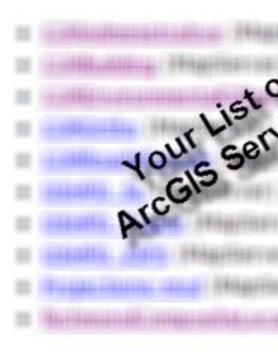
Step 1.2: In the bottom left of the browser screen, locate "Supported Operations"